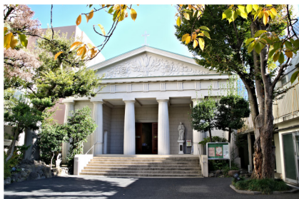
Tsukiji Catholic Church (1927). The gable of the Parthenon-style hall is arranged with the symbol of St. Mary. (Photo by Pentax K-3iii, 5 Nov. 2021)