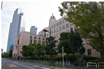
St. Luke's Chapel (1901) and the Old Building of St. Luke's International Hospital with a spire (1933). In the distance, the St. Luke's Garden Tower can be seen. (Photo by Pentax K-3iii, 5 Nov. 2021)