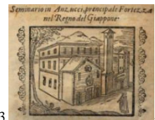
1: The bell of Namban Temple (Myoshinji Temple), 2: Namban Temple Monument (web), 3: Sketch portrait of Organtino (Matsuda), Seminario at Azuchi (Ciappi 1596).