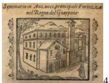
1: The bell of Namban Temple (Myoshinji Temple), 2: Namban Temple Monument (web), 3: Sketch portrait of Organtino (Matsuda), Seminario at Azuchi (Ciappi 1596).