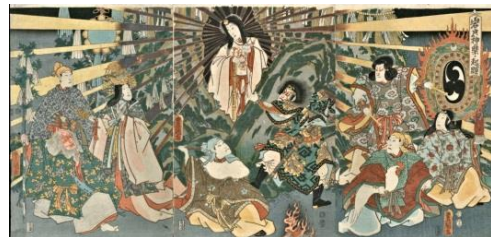
The origin of Ama-no-Iwato Myth (The Dawn of Japan), by The 3rd Toyokuni, 1856 (Kokugakuin Univ.).