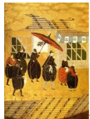
The folding screen of the arrival of a Namban ship (1 pair/ 6 folds), Anonymous. ca. 1620-1625, (Rijksmuseum). 3 is a part of 2.