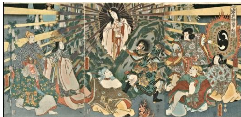
The origin of Ama-no-Iwato Myth (The Dawn of Japan), by The 3rd Toyokuni, 1856 (Kokugakuin Univ.).