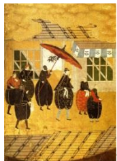
The folding screen of the arrival of a Namban ship (1 pair/ 6 folds), Anonymous. ca. 1620-1625, (Rijksmuseum). 3 is a part of 2.