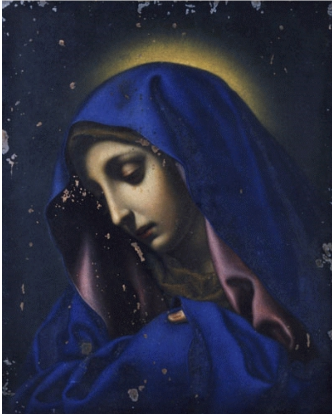
The Virgin of the Thumb , by Agese Dolci (ca.1700) (Named after the left-hand thumb of the Madonna peeping out from her shawl.) Tokyo National Museum/An important cultural asset. http://www.kyuhaku.com/pr/exhibition/exhibition_pre14.html