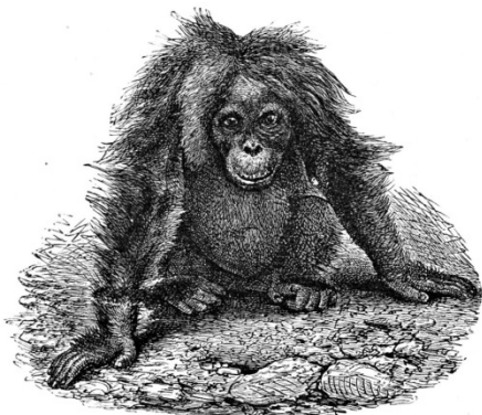
FEMALE ORANG-UTAN. ( From a photograph )

Alfred Russel Wallace, The Malay Archipelago: The land of the bird of paradise , A narrative of travel, with studies of man and nature, Macmillan and Co., London 1869 より複寫。